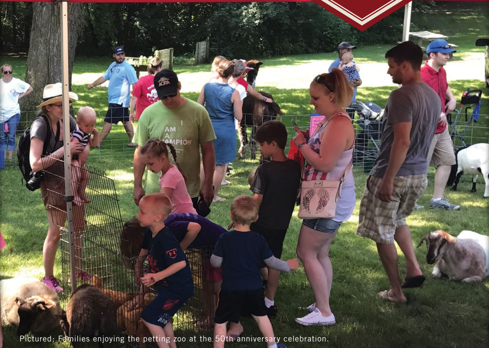
Pictured: Families enjoying the petting zoo at the 50th anniversary celebration.